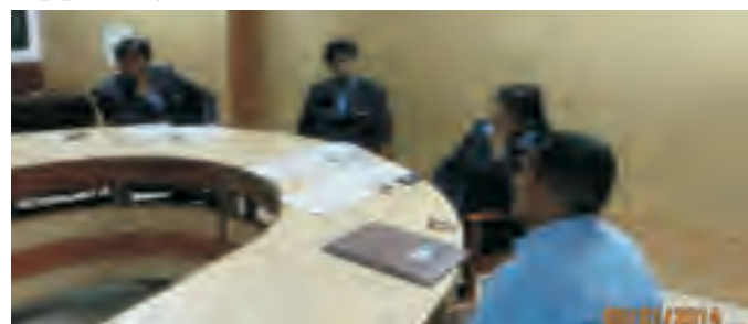
Campus Interview by International Tractor Limited Dt.09-01-2014