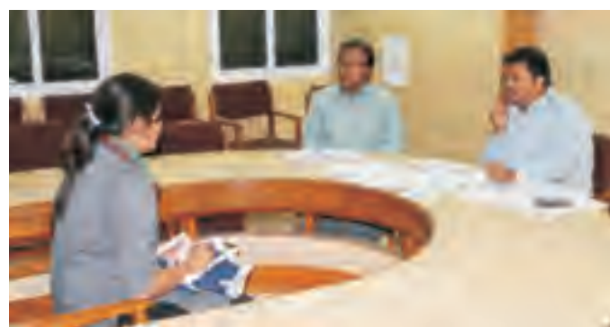
Campus Interview by Development Support System Dt.10/04/2013