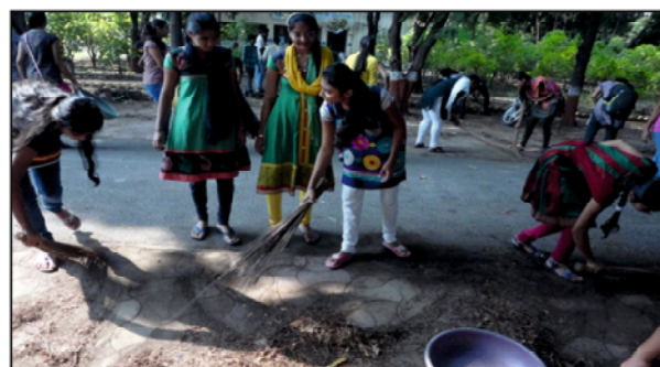
Cleaning under Swachh Bharat Mission Dt.02.10.2014