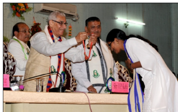
Medals awarded in the 10 th Convocation of JAU Dt. 20. 01. 2015