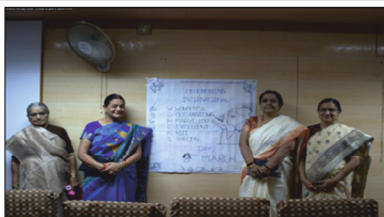
Women Day Celebration Programme Dt.13.03.2015