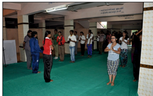
Activities in the NSS District Level Camp at Veraval (Gir-Somnath) Dt.19 to 21.07.2014