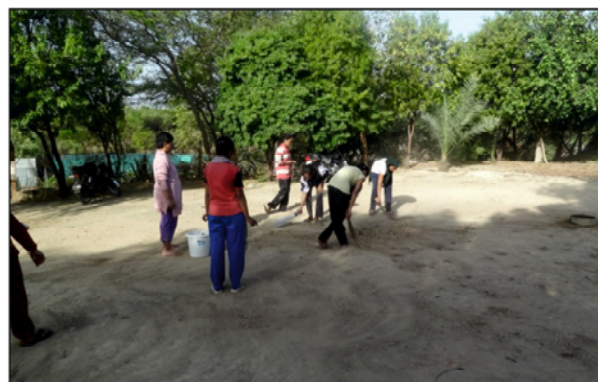
NSS Special Camp at Padariya Dt.18 to 24.02.2015

50 Students participated. Activities: Swachh Bharat Mission, Health Camp, etc.