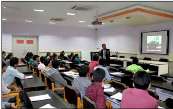
Campus to Corporate Training Programme(C2C) Dt.12.12.2014