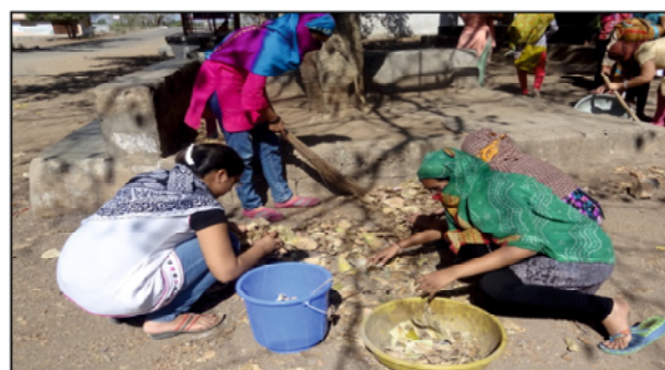
NSS Special Camp at Itali Dt.16 to 22.03.2015

103 Students participated. Activities: Cleaning under Swachha Bharat Mission, Shramyagna at kids' school, socio economic survey of farmers, advises in farmers problems, it's analysis in group, made charts of survey and presentation, cultural programme, scope on agril. enterprise, leadership development, home science camp, preparation of bakery and demonstration, farmer discussion meeting, importance of service of society and nation, eradication of bad habits, etc.