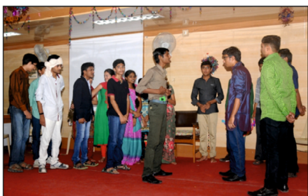
Leadership & Entrepreneurship Development Training by NCCSD, Ahmedabad Dt.24 -25.09.2014