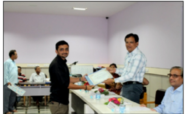
Student Training Programme, Transmind Consultant Dt.20 to 21.02.2015