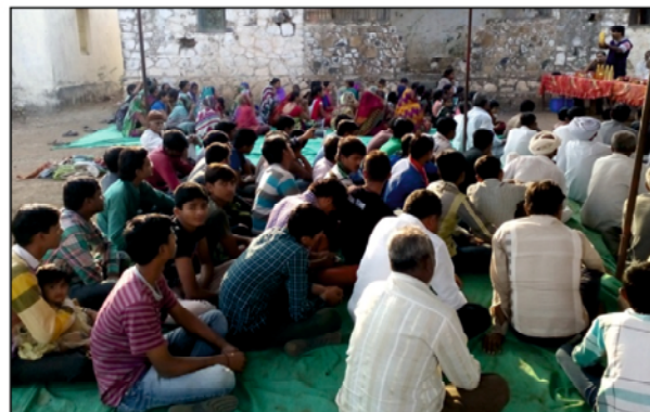
NSS Special Camp at Sukhpur Dt.02 to 08. 02. 2015

50 Students participated. Activities: Cleaning Village, Road Repairing, Animal Health Camp, etc.