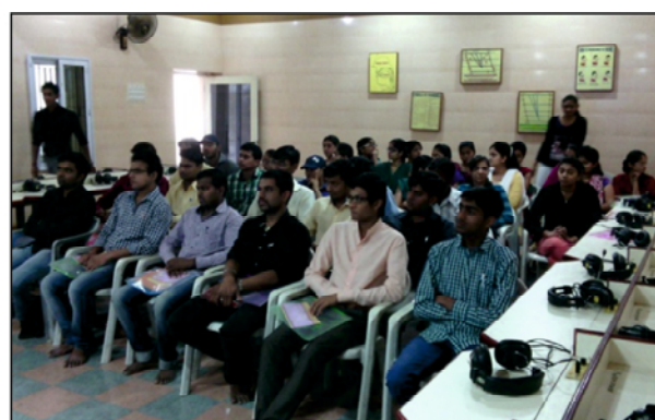
Campus to Corporate Training Programme(C2C) Dt.21.02.2015