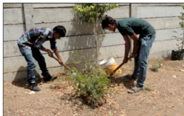
Programme on Awareness to Social Issues Dt.07. 02. 2015