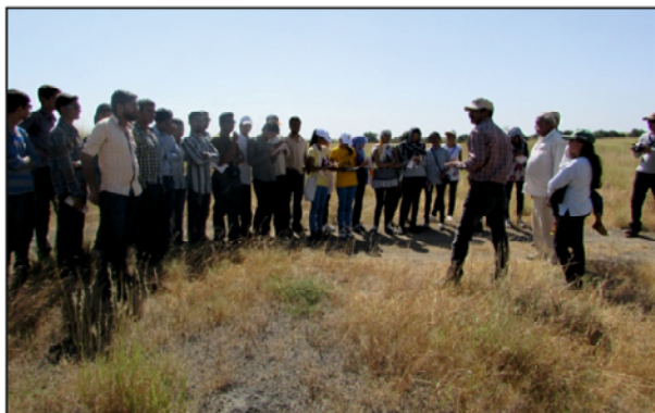
Landscape Ecology Training by Department of Forest(Gir) Dt.18 to 19.10.2014