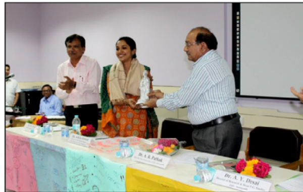
Life Skills & Personality Development Training Programme Dt.16 to 18.03.2015