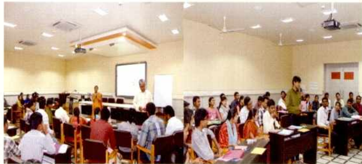
Interactive games on life skills