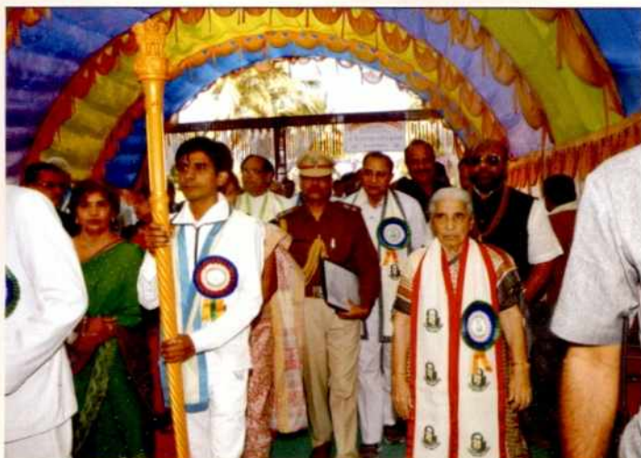
Hon'ble Chancellor, Dr Shrimati Kamla at 9 th convocation procession