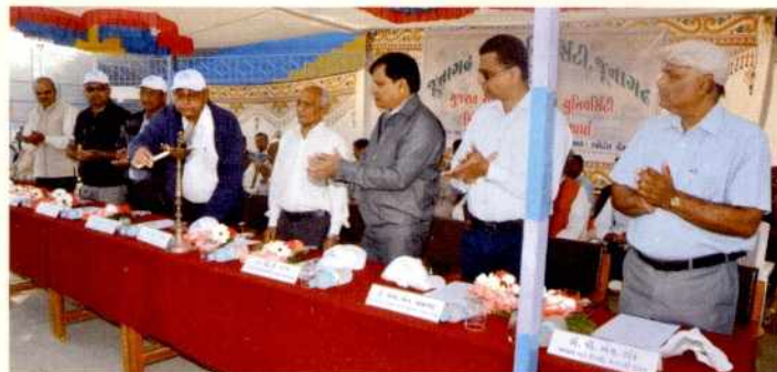
Inauguration of Gujarat State Inter Agricultural University Cricket and Table Tennis Tournaments