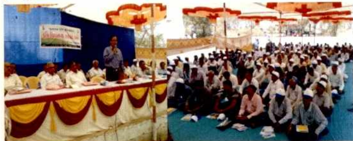
Farmer's Day at Agril. School, Halvad