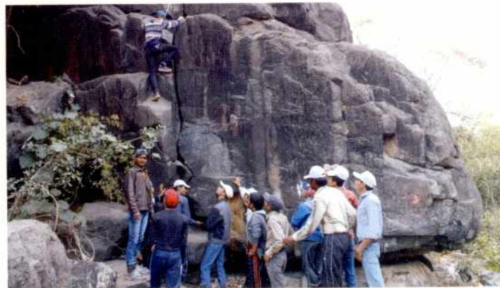
JAU student participation in Basic Course of Mountaineering

With an aim to create adventurous skill in the students, JAU regularly arranges Basic Course of Mountaineering for the students of different Colleges/ Polytechnics. In this year, 103 students participated during January 22-31, 2014.