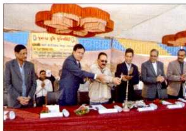
Inauguration of Inter College and Inter Polytechnic Athletics Meet