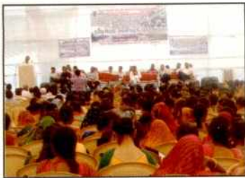
Agri Fair-cum-Crop Seminar at KVK, Nanakandhasar