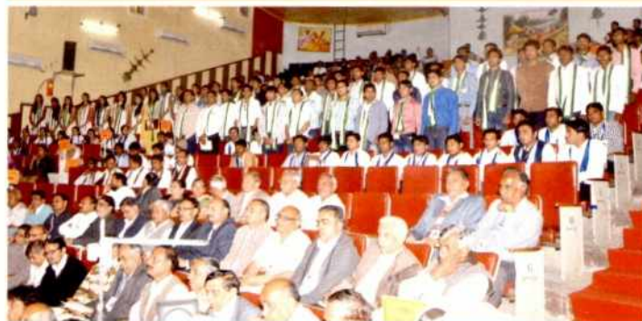
Degree recipients at 9 th convocation