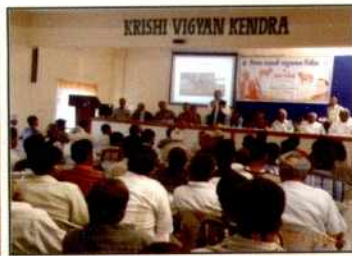
District level Pashupalan Shibir at KVK, Nanakandhasar